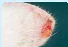
Ear tip of a cat showing cancerous changes

Please don't hesitate to contact us if you would like further information on preventing or treating this serious condition.